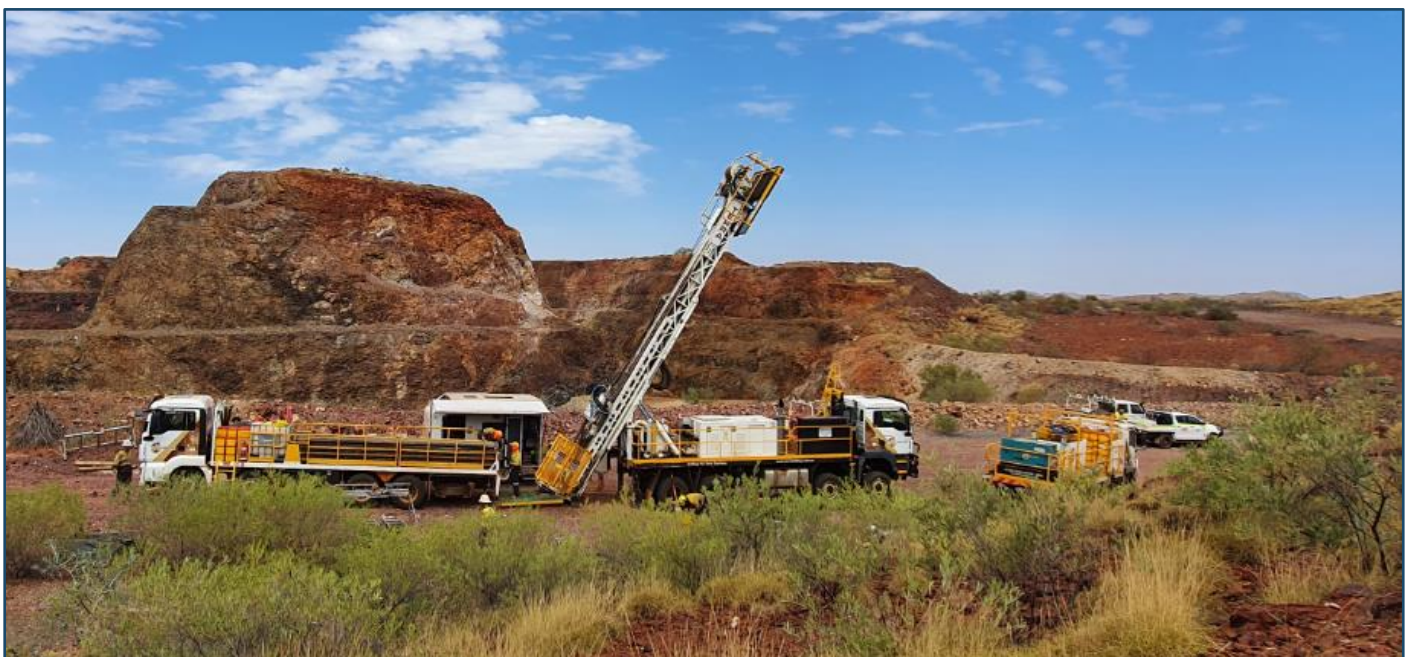
Image 1: Diamond Drilling at Mons Cupri, Whim Creek Project

Drilling is expected to be completed in the second half of November with geotechnical logging, ore sorting and metallurgical test work to be initiated as soon as possible. Further information detailing the scope and timing of the PFS will be provided in the coming weeks.