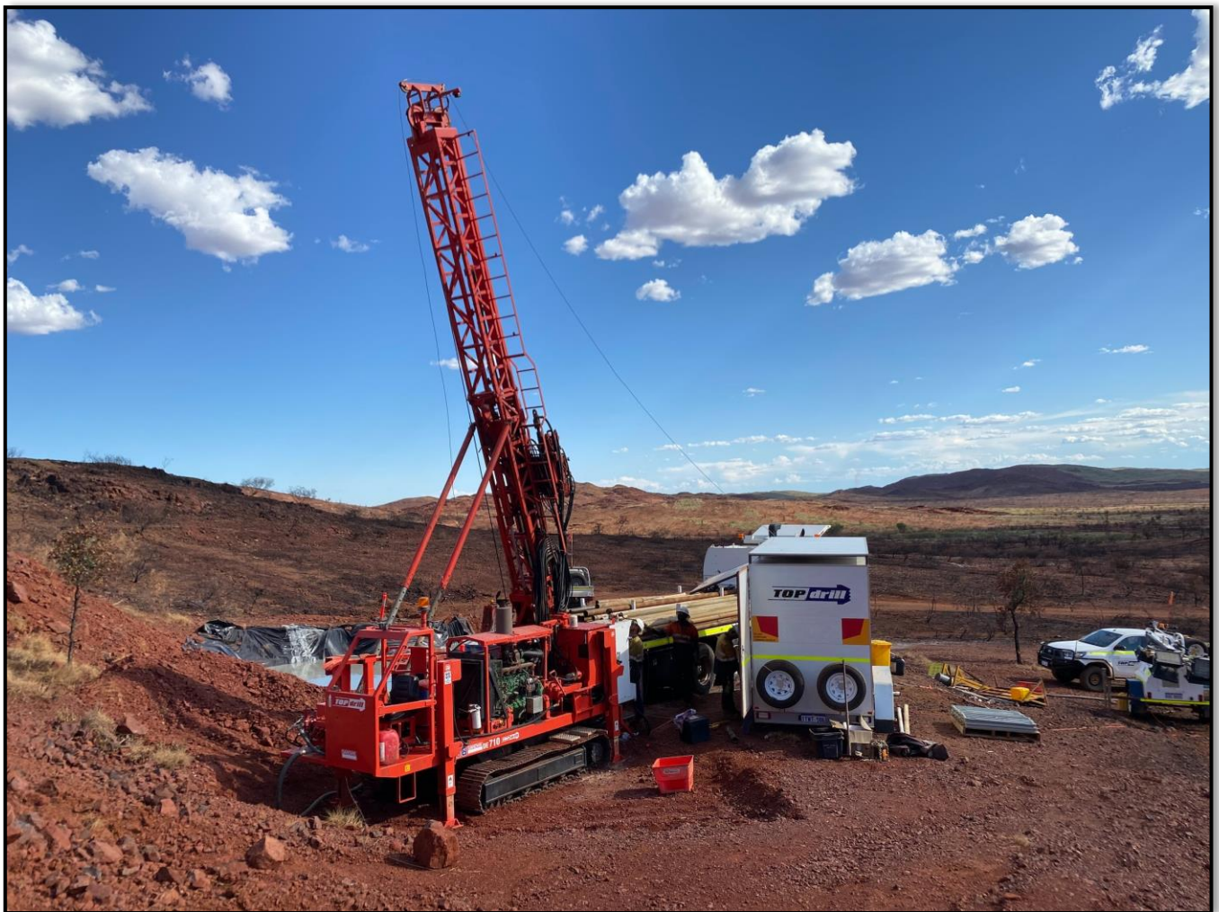
Figure 2: Diamond Drilling at Mons Cupri, Whim Creek Project

Drilling is expected to be completed in early March 2022 with metallurgical test work for Evelyn and Salt Creek to be initiated as soon as possible. Flotation test work for Mons Cupri and Whim Creek is largely complete and has confirmed or improved on previous test work campaigns.