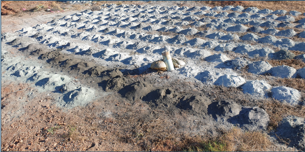
Figure 2: Massive sulphide mineralisation (dark samples) intersected within 22AER005B

In mid-2022, the Company drilled two RC holes at Evelyn. The initial hole was abandoned due to excessive deviation and despite also experiencing substantial deviation, the second hole, 22AER005B , intersected 13m @ 4.46% Cu, 3.10% Zn, 45 g/t Ag and 1.61 g/t Au from 204m (Figure 2). 1