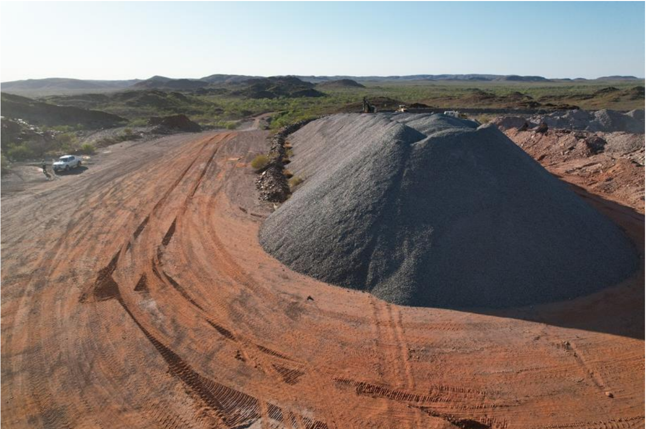
Figure 1: Commercial scale waste rock to road base trial product

Test work has confirmed that a simple screening operation at -19mm can produce a product that exceeds the Main Roads Western Australia specification for base course for the Pilbara Region ( Figure 1 ). The +19mm fraction can then be crushed to 100% passing 20mm with a jaw crusher also to produce a base course that exceeds the requirements of Main Roads WA.